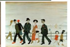
On the Promenade 1955