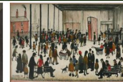
Punch and Judy 1943